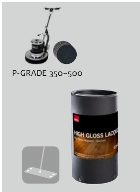
For high gloss floors.