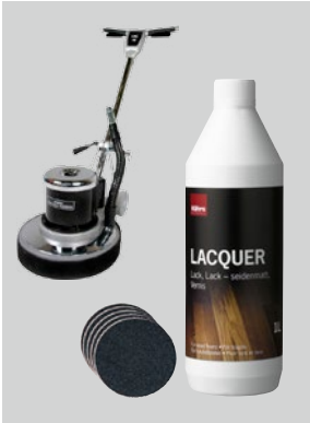
For satin lacquered floors

The main reason for re-lacquering is that after many years' use, the floor needs to be "freshened up".