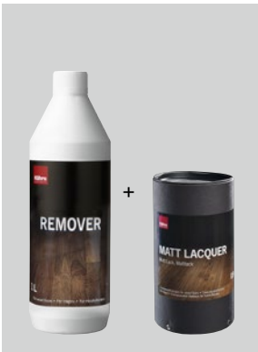
For matt lacquered floors

Allow at least 3 weeks before using strong alkaline cleaning products.