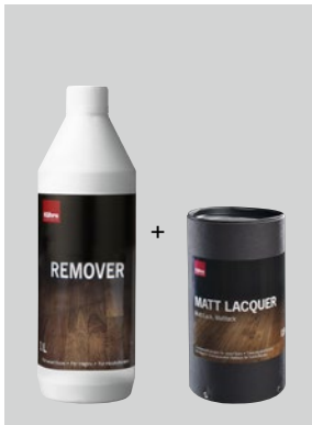
For matt lacquered floors

Allow at least 3 weeks before using strong alkaline cleaning products.