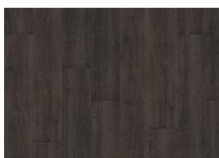
Valdivian - Dry back