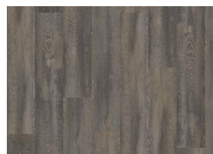
Daintree - Dry back