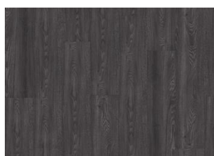
Humboldt - Dry back