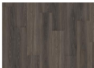
Tongass - Dry back