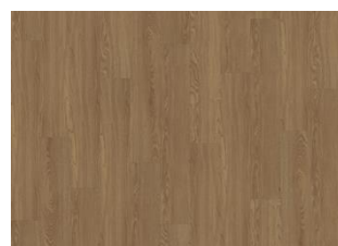
Sherwood - Dry back