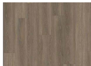
Tiveden - Dry back