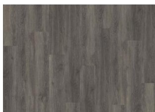
Niagara - Dry back