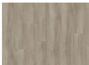
Snowdonia - Dry back