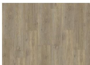
Taiga - Dry back