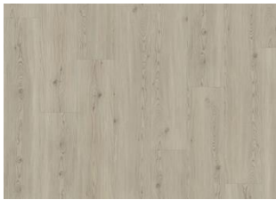
Triglav - Dry back