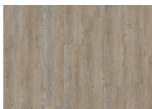
Cormorant - Dry back