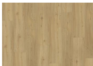
Oulanka - Dry back