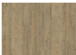
Waipoua - Dry back