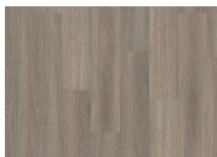
Whinfell - Dry back