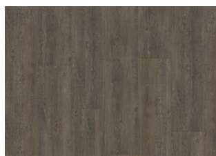
Gorbea - Dry back