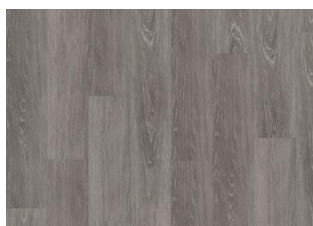
Stanton - Dry back