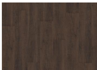
Burnham - Dry back