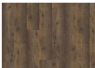
Komi - Dry back