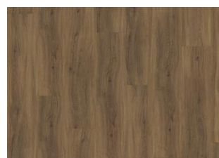
Redwood - Dry back