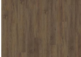
BELLUNO DRY BACK