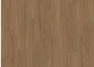
SHERWOOD DRY BACK