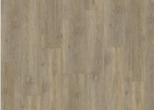
TAIGA DRY BACK