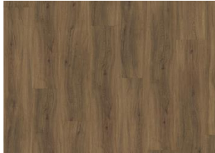
Redwood - Dry back