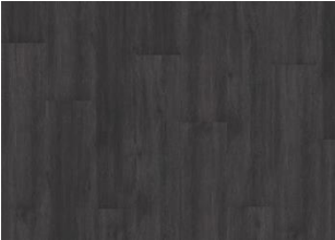
Schwarzwald - Dry back