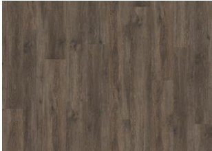
Saxon - Dry back