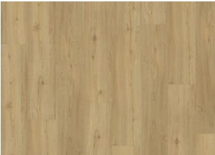
Oulanka - Dry back