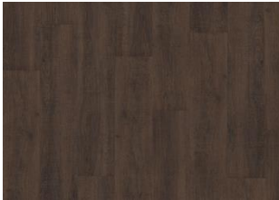
Burnham - Dry back