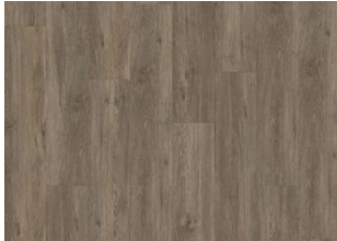
Sarek - Dry back