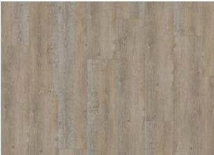
Cormorant - Dry back