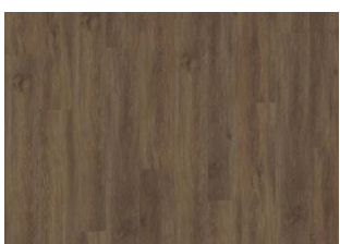
Belluno - Dry back