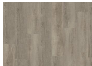
Riva - Dry back