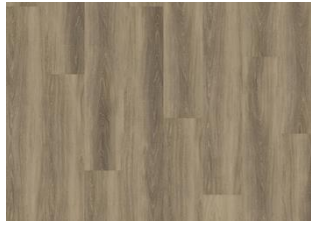
Hanmer - dry back