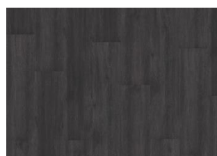
Schwarzwald - Dry back