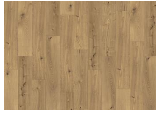
Moesgaard - dry back