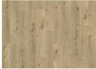
Coconino - dry back