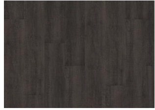
Valdivian - Dry back