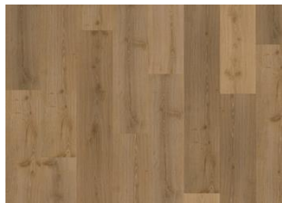
Akkelis - dry back