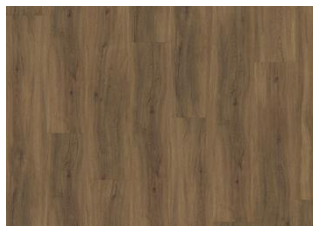
Redwood - Dry back