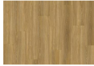
Fontin - dry back