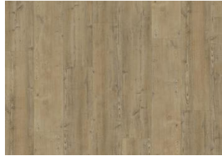
Waipoua - Dry back