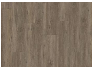
Sarek - Dry back