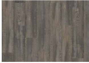
Daintree - Dry back