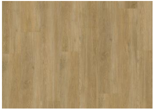
Sapo - dry back