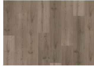
Blaiken - dry back