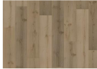
Foloi - dry back