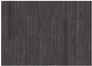
Humboldt - Dry back