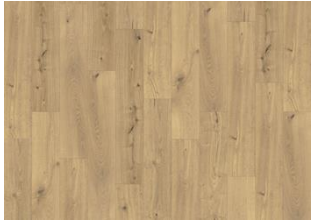
Thuringian - dry back