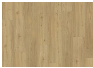
Oulanka - Dry back