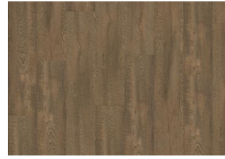
Durmitor - Dry back