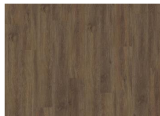
Belluno - Dry back