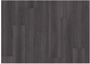
Calder - Dry back