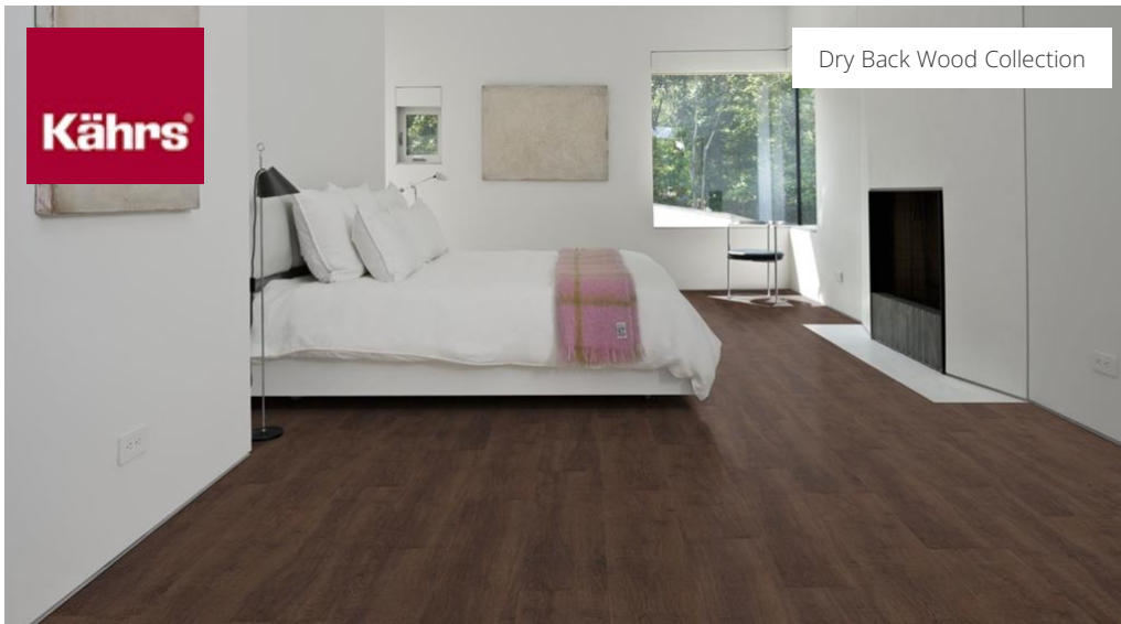
Dry Back Wood Collection