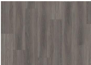
WENTWOOD DRY BACK