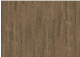
DURMITOR DRY BACK