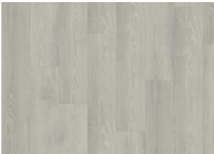
YUKON DRY BACK