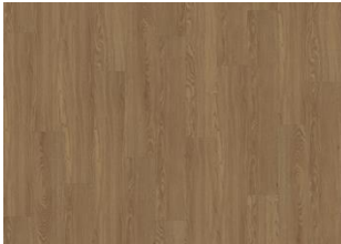
SHERWOOD DRY BACK