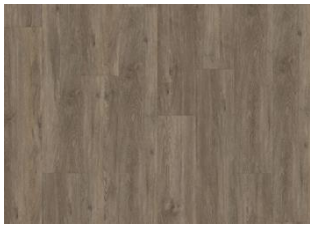
SAREK DRY BACK