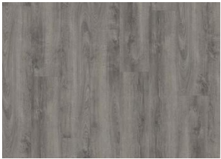
PLITVICE DRY BACK