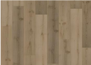
FOLOI DRY BACK