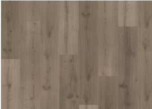
BLAIKEN DRY BACK