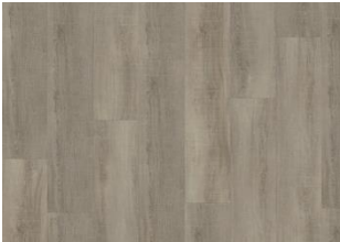
RIVA DRY BACK