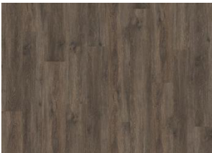
SAXON DRY BACK