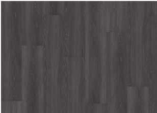
CALDER DRY BACK