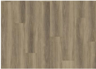
HANMER DRY BACK