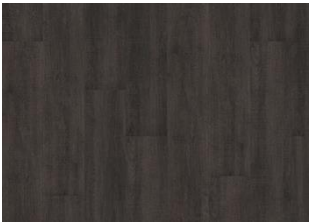
VALDIVIAN DRY BACK