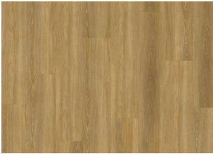
FONTIN DRY BACK