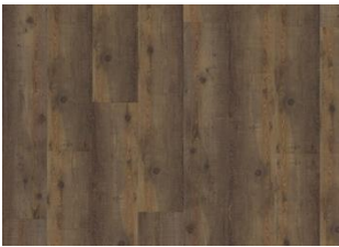
KOMI DRY BACK