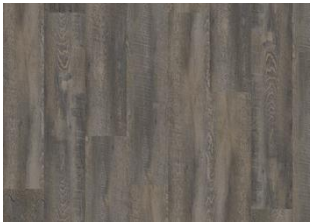
DAINTREE DRY BACK