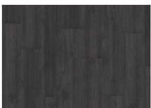
Schwarzwald - Dry back