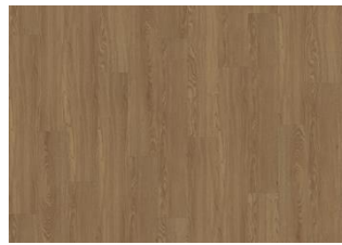
Sherwood - Dry back