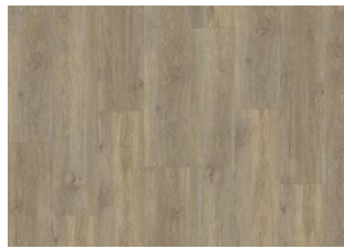
Taiga - Dry back