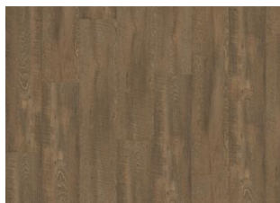
DURMITOR DRY BACK