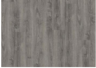
PLITVICE DRY BACK