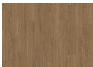
SHERWOOD DRY BACK