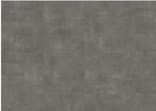
KEBNEKAISE DRY BACK