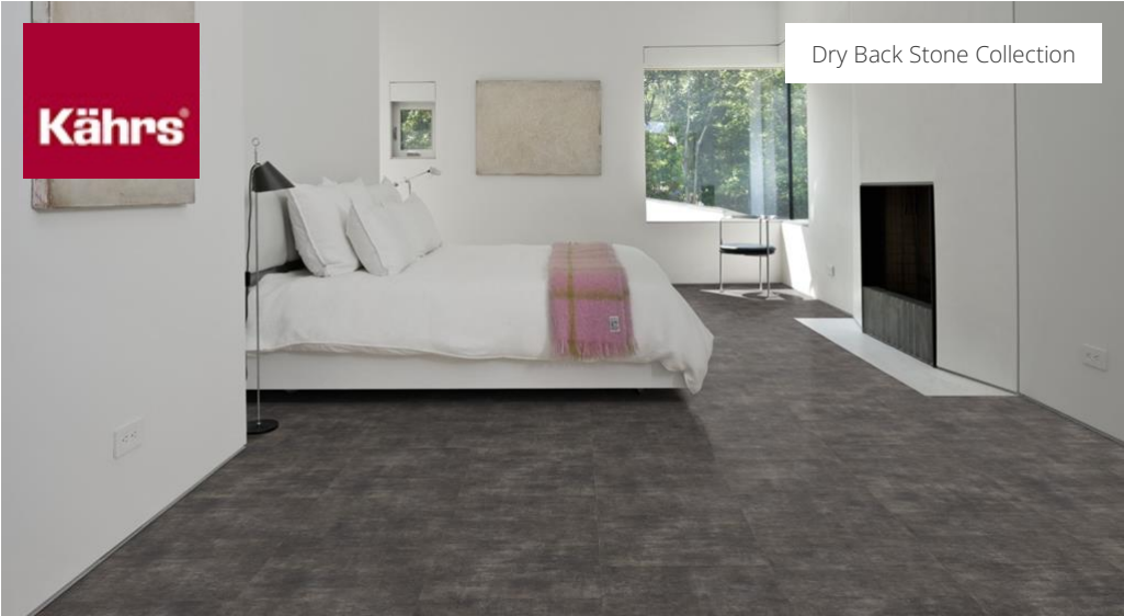
Dry Back Stone Collection