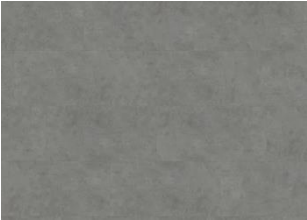
MAKALU DRY BACK