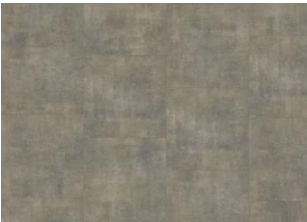
MONT BLANC DRY BACK