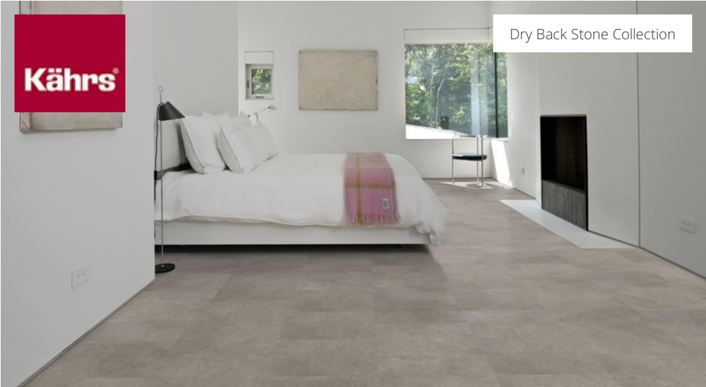
Dry Back Stone Collection