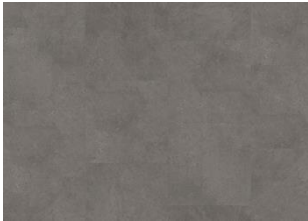
Grossglockner - Dry back