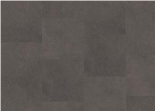
Kilimanjaro - Dry back