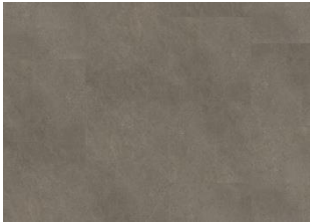
Broad Peak - Dry back