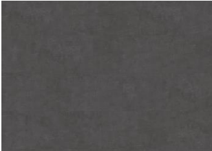
Schwarzhorn - Dry back