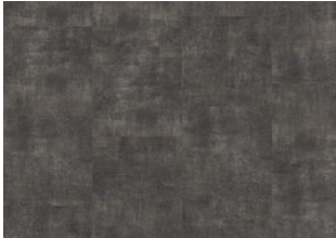
Steele - Dry back