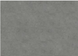
Makalu - Dry back