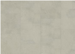
Lhotse - Dry back

All samples, images and product description, plus photo and brochure specifications are there for the sole purpose of giving an approximate idea of the items described in them. They shall not form part of the contract or have any contractual force and should be viewed for illustrative purposes only. We cannot guarantee that your computer's display or the quality of the print will accurately reflect the colour of the products. Your product may vary slightly from the images within this literature.