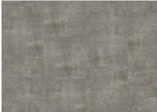
Matterhorn - Dry back