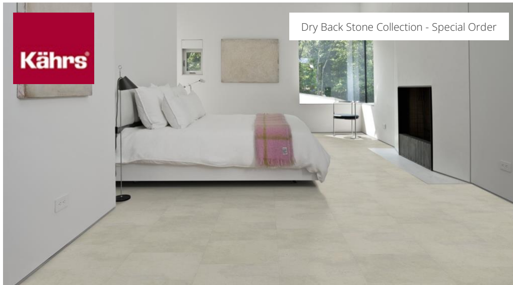
Dry Back Stone Collection - Special Order