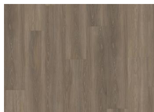
Tiveden - Dry back