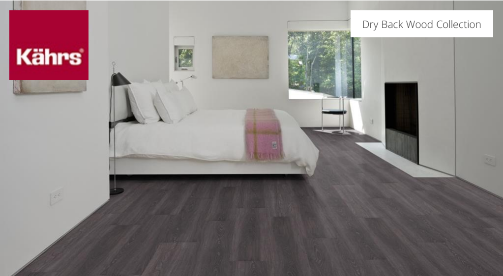
Dry Back Wood Collection