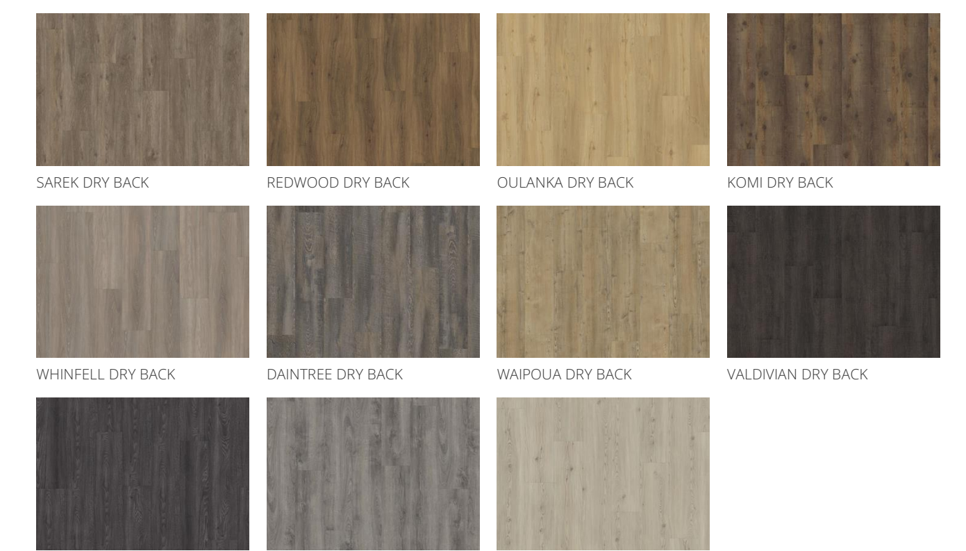
HUMBOLDT DRY BACK