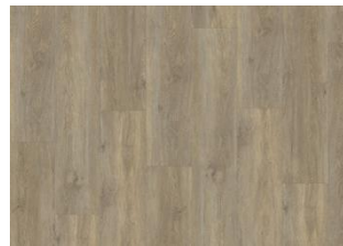
Taiga - Dry back