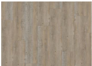
Cormorant - Dry back