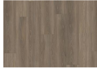
Tiveden - Dry back