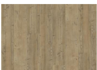
Waipoua - Dry back