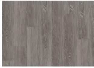
Stanton - Dry back