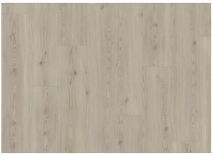
Triglav - Dry back