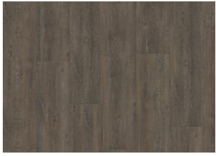
Gorbea - Dry back