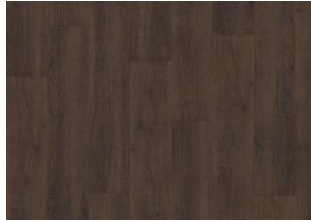
Burnham - Dry back