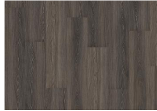
Tongass - Dry back