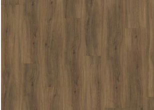
REDWOOD - DRY BACK