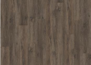
SAXON - DRY BACK