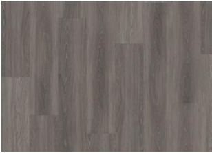
WENTWOOD - DRY BACK