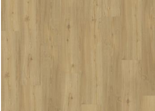
OULANKA - DRY BACK