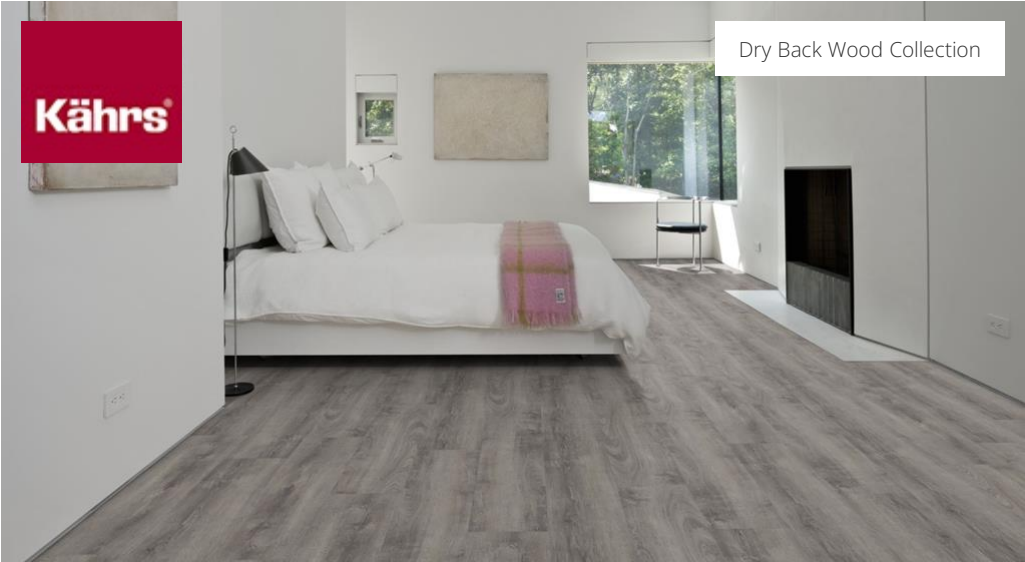
Dry Back Wood Collection