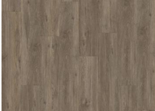
SAREK - DRY BACK