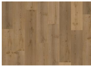
Akkelis - dry back