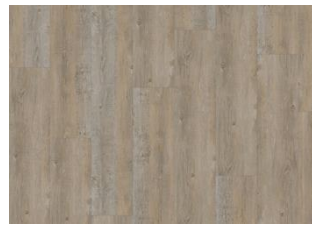
Cormorant - Dry back