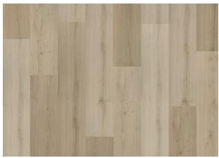
Kilsbergen - dry back