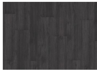
Schwarzwald - Dry back