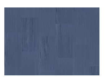
Quartz Lines 8257 Blue