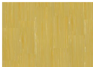
Quartz Lines 8229 Amber Yellow