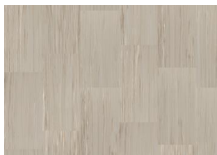
Quartz Lines 8222 Nude Limestone