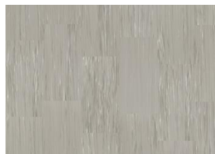
Quartz Lines 8202 Conglomerate Grey