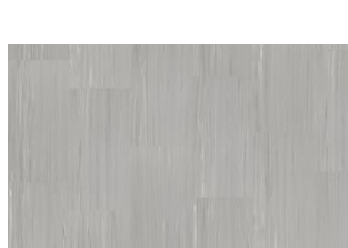
Quartz Lines 8214 Thunder