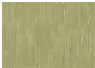
Quartz Lines 8265 Prosperous Peridot