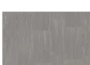
Quartz Lines 8215 Lava Grey