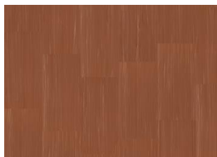
Quartz Lines 8244 Tigereye Red