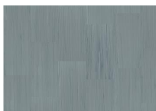
Quartz Lines 8253 Blue Chalcedony