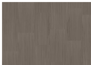
Quartz Lines 8224 Hypersthene Ash