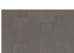
Quartz Lines 8204 Scoria Grey