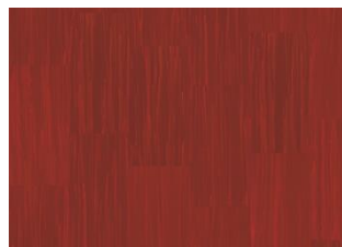
Quartz Lines 8249 Crocoite Red