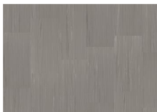
Quartz Lines 8203 Gabbro Grey