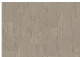
Quartz Lines 8223 Modest Cancrinite