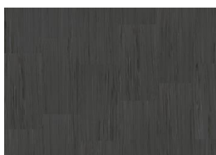
Quartz Lines 8217 Zebra Jasper