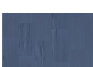
Quartz Lines 8257 Blue