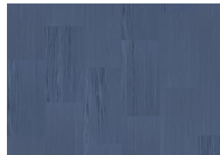
Quartz Lines 8257 Blue