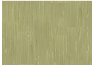
Quartz Lines 8265 Prosperous Peridot