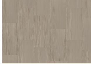
Quartz Lines 8223 Modest Cancrinite