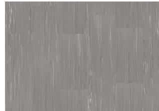
Quartz Lines 8215 Lava Grey