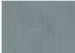
Quartz Lines 8253 Blue Chalcedony