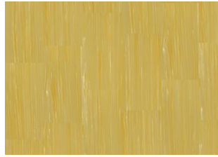
Quartz Lines 8229 Amber Yellow