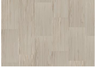
Quartz Lines 8222 Nude Limestone