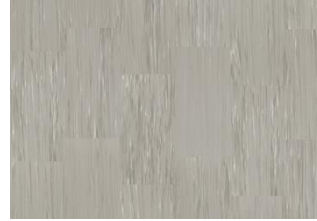
Quartz Lines 8202 Conglomerate Grey