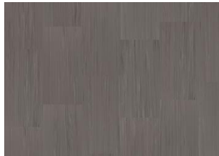
Quartz Lines 8204 Scoria Grey