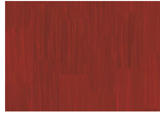
Quartz Lines 8249 Crocoite Red