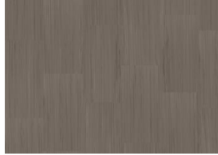
Quartz Lines 8224 Hypersthene Ash