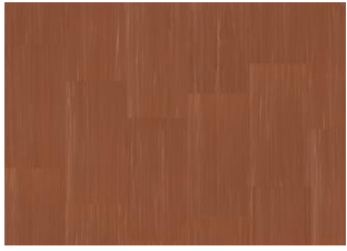
Quartz Lines 8244 Tigereye Red