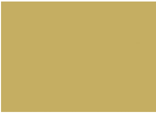
Quartz Uni 8029 Amber Yellow