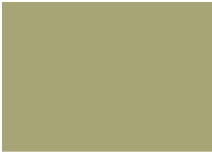
Quartz Uni 8065 Prosperous Peridot