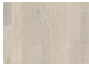
Oak Nouveau Snow