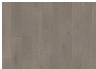
Oak Nouveau Taupe