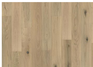
Oak Nouveau Whisper