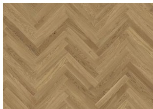
Oak Studio CD