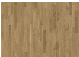
Oak Studio CD