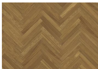
Oak Studio AB