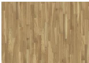
Studio Oak CC 11 mm