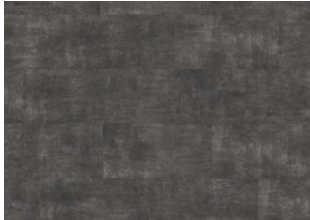
Steele - Click 5 mm