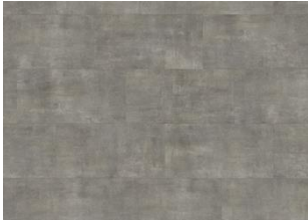
Matterhorn - Click 5 mm

All samples, images and product description, plus photo and brochure specifications are there for the sole purpose of giving an approximate idea of the items described in them. They shall not form part of the contract or have any contractual force and should be viewed for illustrative purposes only. We cannot guarantee that your computer's display or the quality of the print will accurately reflect the colour of the products. Your product may vary slightly from the images within this literature.