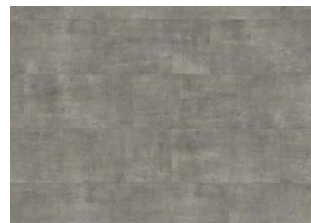
Matterhorn - Click 5 mm