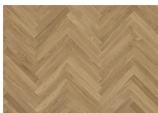
OAK STUDIO AB MATT