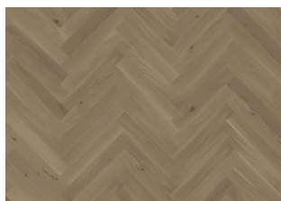
OAK STUDIO CC GREY