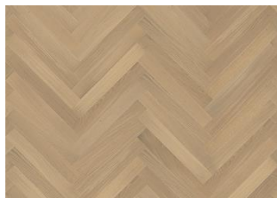
OAK STUDIO AB WHITE MATT