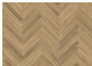
OAK STUDIO AB WHITE OILED