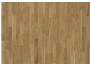
OAK STUDIO CD OILED