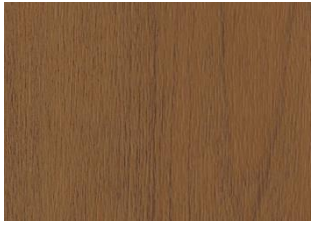
XPRESSION American Cherry