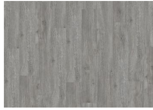
XPRESSION Cool Grey