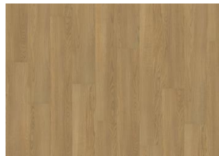
XPRESSION Golden Oak