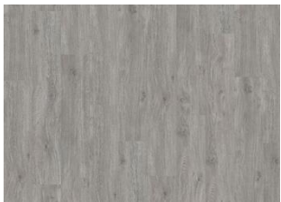
XPRESSION Warm Grey