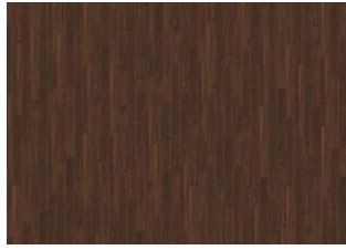
XPRESSION French Walnut