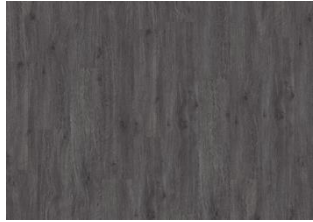
XPRESSION Dark Grey