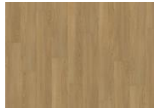
XPRESSION Golden Oak