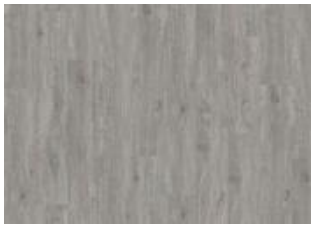
XPRESSION Warm Grey