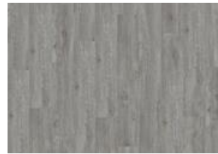
XPRESSION Cool Grey