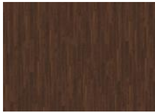
XPRESSION French Walnut