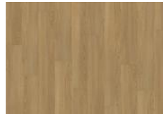
XPRESSION Golden Oak