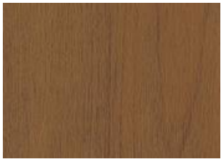
XPRESSION American Cherry