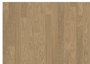
Light Suede Narrow