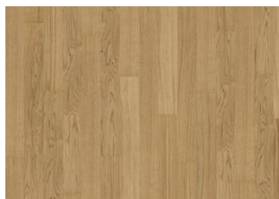
Pure Oak Narrow