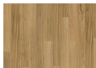
Pure Oak Wide