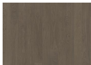
Faded Black Wide