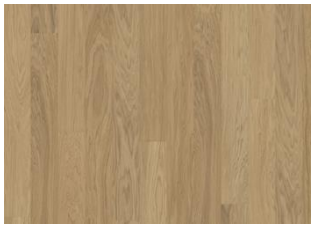
Light Suede Wide