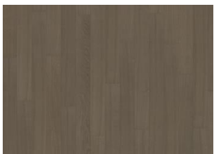
Faded Black Narrow