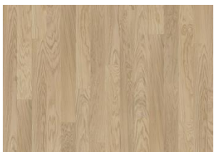
Whole Grain Narrow