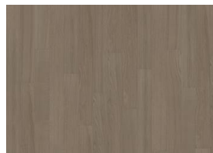
Earl Grey Narrow