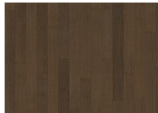
Cocoa Bean Narrow