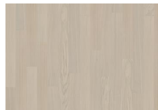
Coconut Cream Narrow