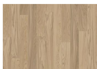
Whole Grain Wide