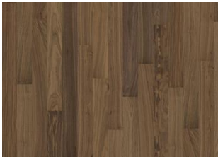
PURE WALNUT NARROW