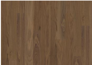
PURE WALNUT WIDE