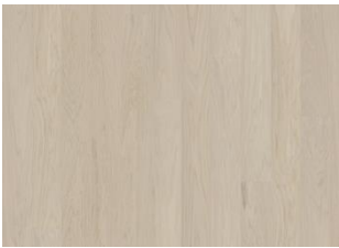
COCONUT CREAM WIDE