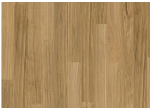
PURE OAK WIDE