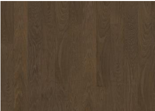
COCOA BEAN WIDE