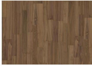
PURE WALNUT 2-STRIP