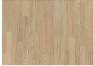
WHOLE GRAIN 2-STRIP