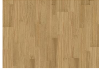
PURE OAK 2-STRIP