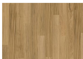
PURE OAK WIDE