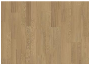
LIGHT SUEDE 2-STRIP