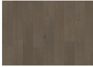
FADED BLACK 2-STRIP