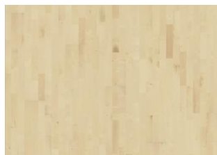
European Maple Gotha