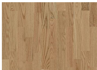
Red Oak Nature