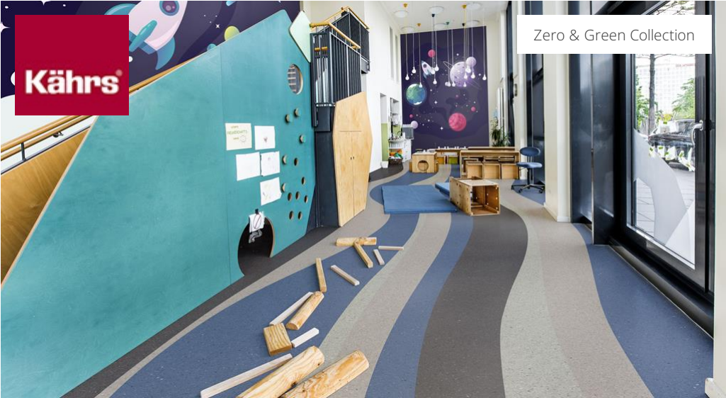
Zero & Green Collection