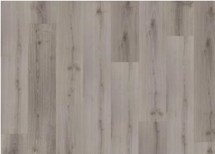
OTAGO - CLICK 6 MM