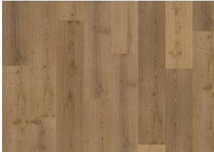
AKKELIS - CLICK 6 MM