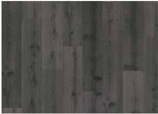
DIDNOK - CLICK 6 MM