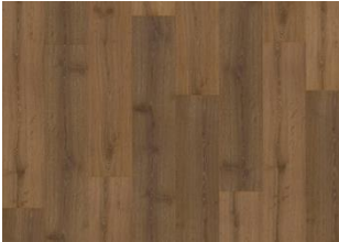
TAKAYNA - CLICK 6 MM