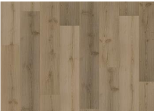
FOLOI - CLICK 6 MM