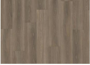
Tiveden - Click 6 mm