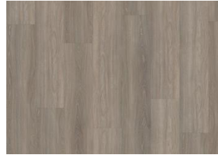
Whinfell - Click 6 mm