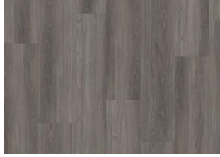
Wentwood - Click 6 mm