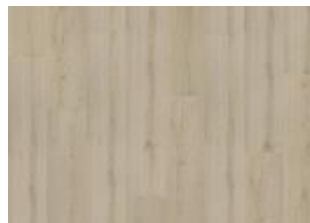
Kilsbergen - Click 6 mm