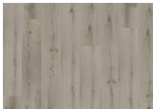
Otago - Click 6 mm