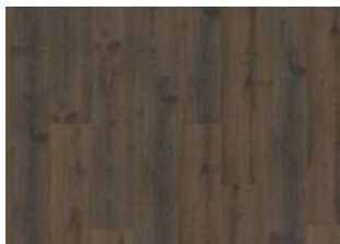
Pando - Click 6 mm