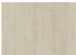
Irati - Click 6 mm