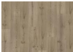
Blaiken - Click 6 mm