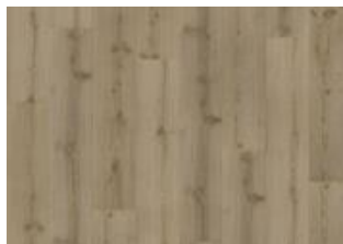
Foloji - Click 6 mm