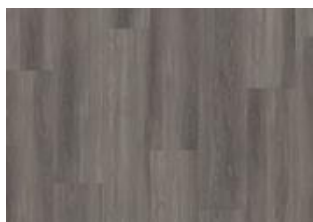
Wentwood - Click 6 mm