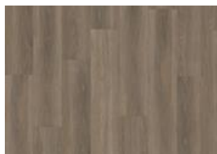
Tiveden - Click 6 mm