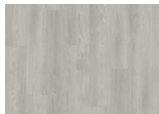
Yukon - Click 6 mm