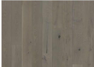
Pearl Grey Plank