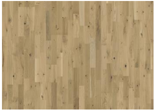
Urban Brown Strip