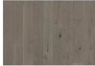
Pearl Grey Plank