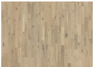
Frosted Oat Strip