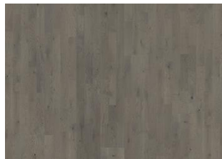
Pearl Grey Strip