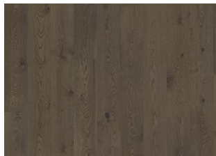
Oak Charcoal Light Plank