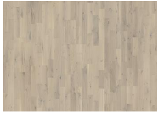
Loft White Strip