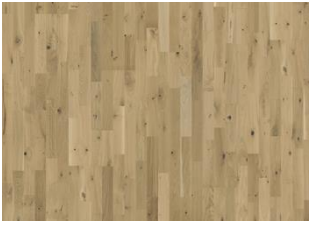
Oak Urban Brown Strip