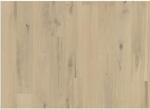
Oak Frosted Oat Plank