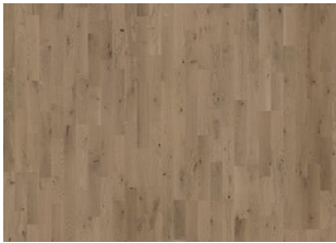
Frozen Hazelnut Strip