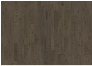
Charcoal Light Strip