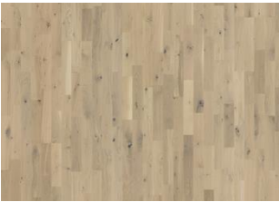
Frosted Oat Strip