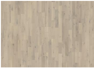
Loft White Strip