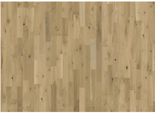
Urban Brown Strip