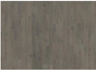
Pearl Grey Strip