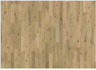
Urban Brown Strip