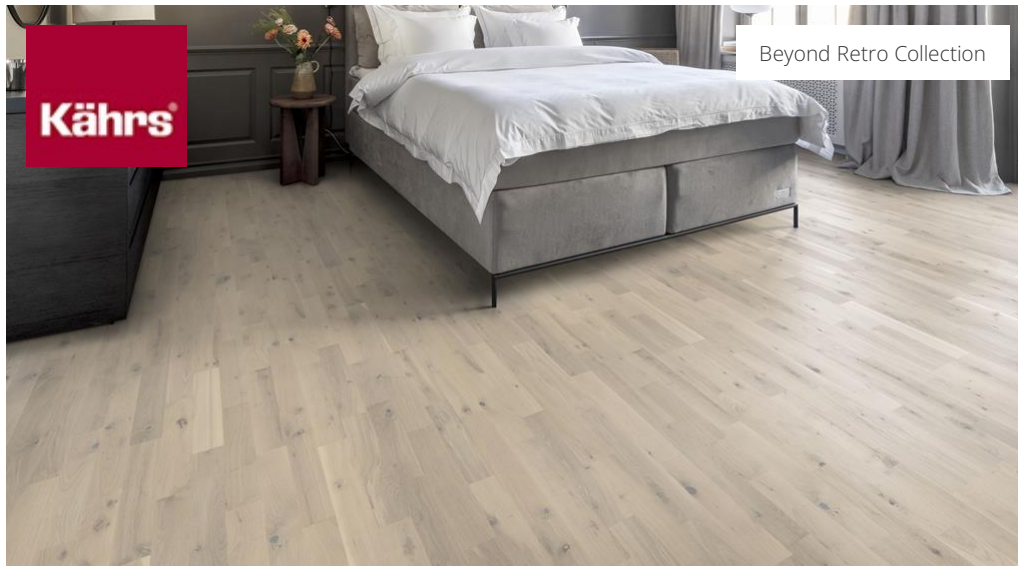
Beyond Retro Collection