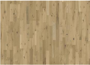
OAK URBAN BROWN STRIP