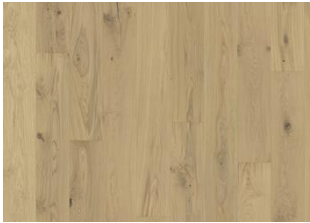
Urban Brown Plank