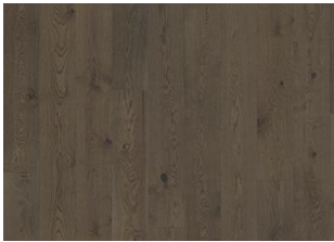
Charcoal Light Plank