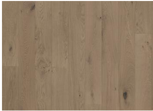
Frozen Hazelnut Plank