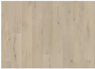
Loft White Plank