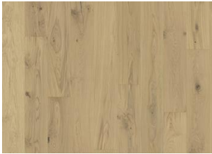
Urban Brown Plank